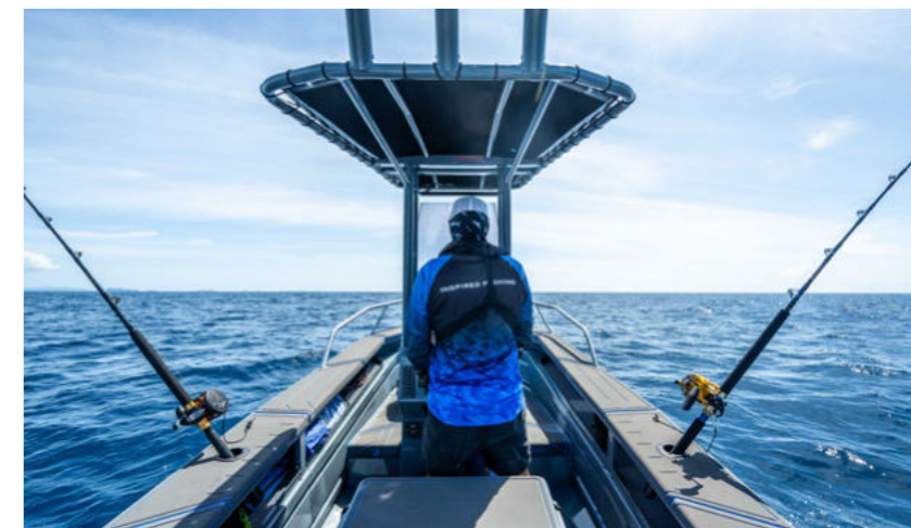
The T-top offers much needed shade when fishing in scorching summer conditions.