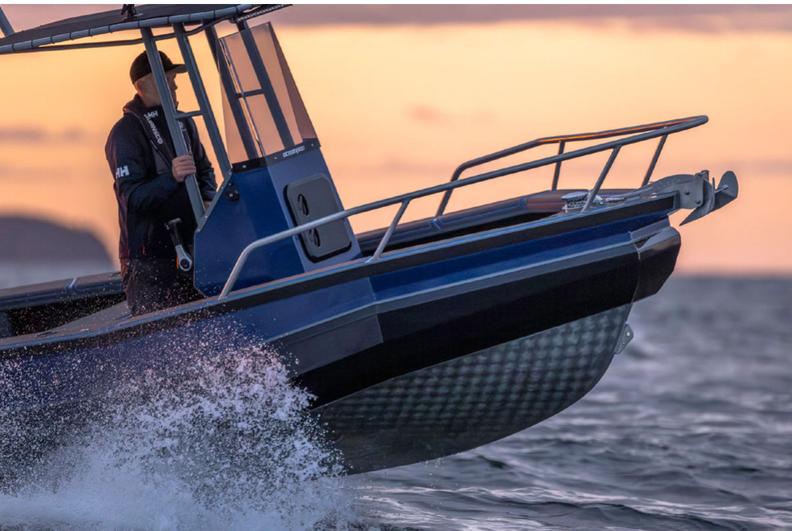
The pontoon centre console is built strong with 4mm hull and frames, with 1310L of reserve buoyancy.

understand that, but the real appeal and advantages of fishing from centre consoles has helped change buyer decisions and drive the explosion of console models now available.